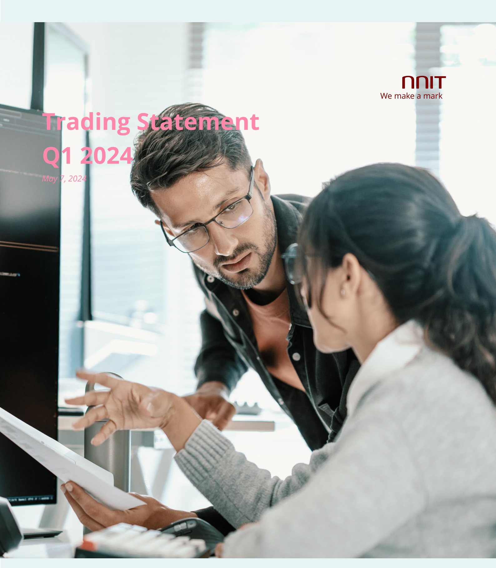
NNIT A/S | Østmarken 3A | DK-2860 Søborg | Denmark | www.nnit.com | Company reg. no.: 21093106